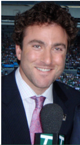
Hosted by: Justin Gimelstob